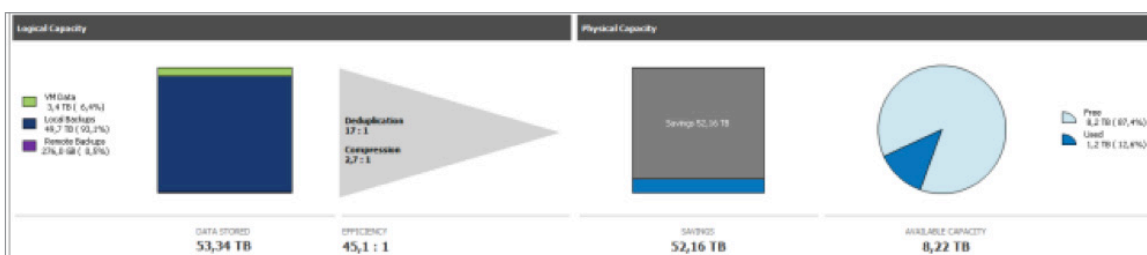
53 TB of logical data consumes only 1.2 TB of physical storage

Based on the success of the initial project, Simac has purchased additional SimpliVity units and plans to migrate all of the company's internal applications to the new hyperconverged infrastructure.